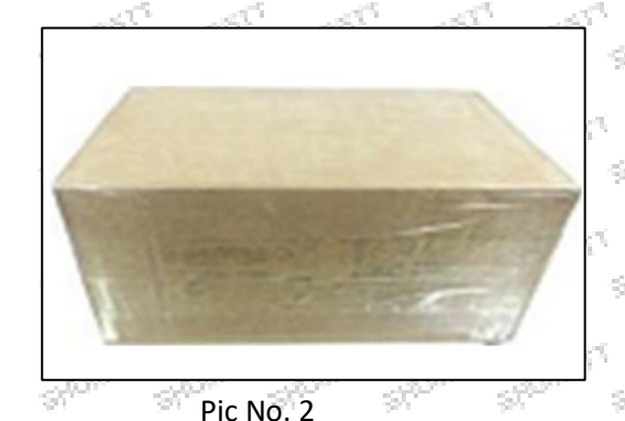
Domestic express packaging: Wrapped with Transparent tape

Minors are prohibited from using transparent tape, yellow tape, black wrapping protective film, and white wrapping protective film to avoid personal injury.